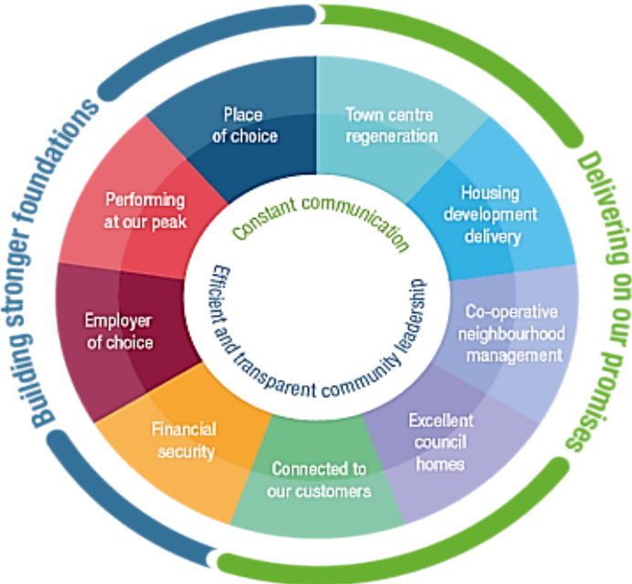
Figure 1: Future Town, Future Council Programme