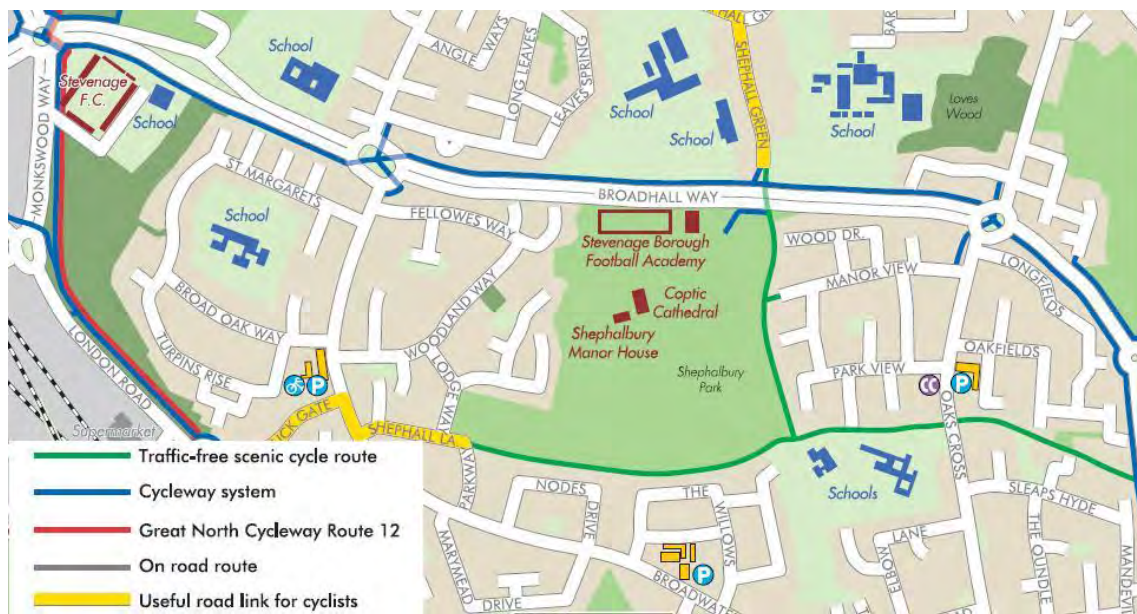
Figure 16 Map showing cycle routes in and around the Broadwater (Marymead) Conservation Area

9.31 There are a number of links through and near the conservation area. Along the northern edge of the conservation area itself there is a scenic cycle route along Shephal Lane. This route links into the Stevenage Cycleway to the north and east at Broadhall Way. These routes are publicised on the Stevenage Cycle Map (available from the Stevenage Borough Council website). We will encourage the promotion of pedestrian and cycle links as they bring movement into the area, encourage sustainable travel and improve local knowledge of the special historical characteristics of the Broadwater (Marymead) Conservation Area.