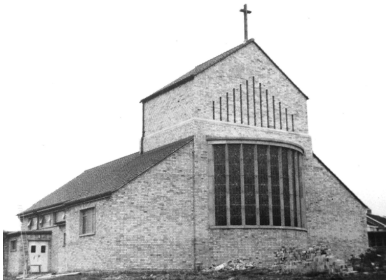
Figure 4 The Church of St. Peter shortly after construction

5.6 The church of St Peter was designed in 1954 by N. F. Cachemaille-Day and Partners, and constructed in 1955. The church became one of the local landmark buildings, mainly due to its interesting architectural design and attractive east elevation.