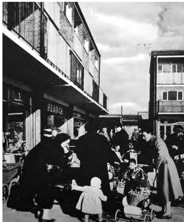
Figure 5 Marymead shops, Broadwater (Collings, 1987)

5.9 The primary school followed in 1959, with later development comprising of the construction of Burydale Children's Home and Gladstone Court (flats for the elderly), the tallest building in the area at six storeys. This development led to a complete neighbourhood where one could live from birth to old age, a principle which was reflected in the Building for Life criteria (3) .