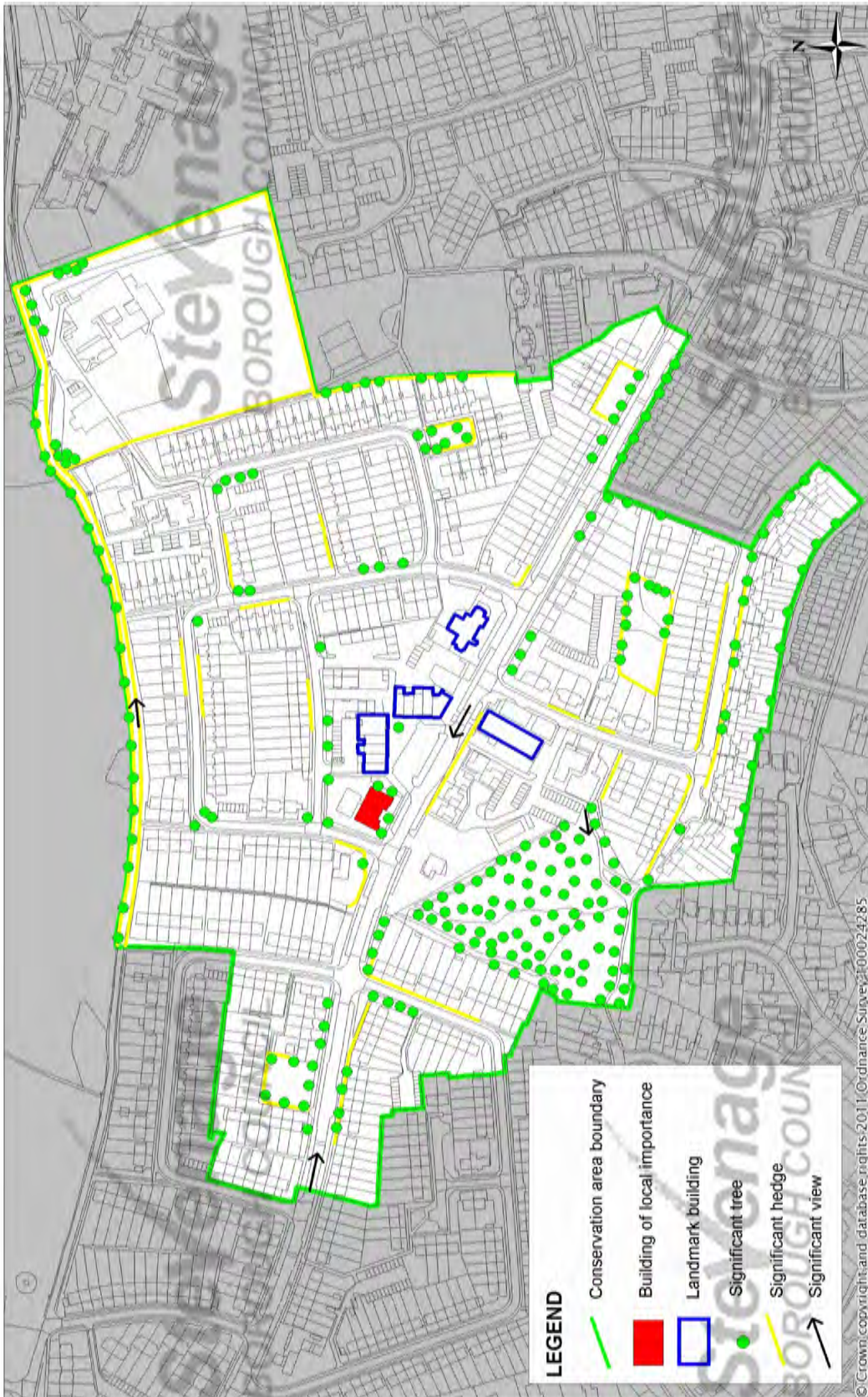
Figure 6 A character analysis of the Broadwater (Marymead) Conservation Area