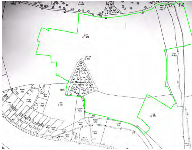
Figure 2 Ordnance Survey Map of the Broadwater (Marymead) site in 1923 (green line denotes current conservation area boundary)

5.1 The conservation area lies approximately two miles to the south of the town centre, beyond Shephalbury Park. The area originally consisted of open fields, with Marymead Spring clearly visible, as shown by figure 2.