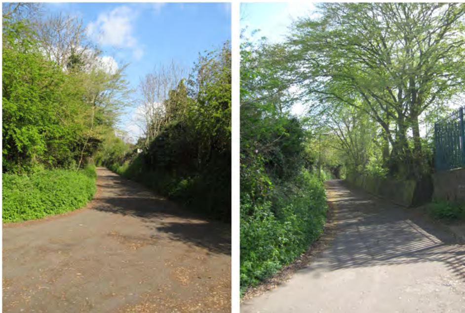
Figure 10 Scenic cycle routes along Shephall Lane

8.5 Cycling and pedestrian routes are important considerations for sustainable transport and there are a number of routes through the area, as figure 10 illustrates.