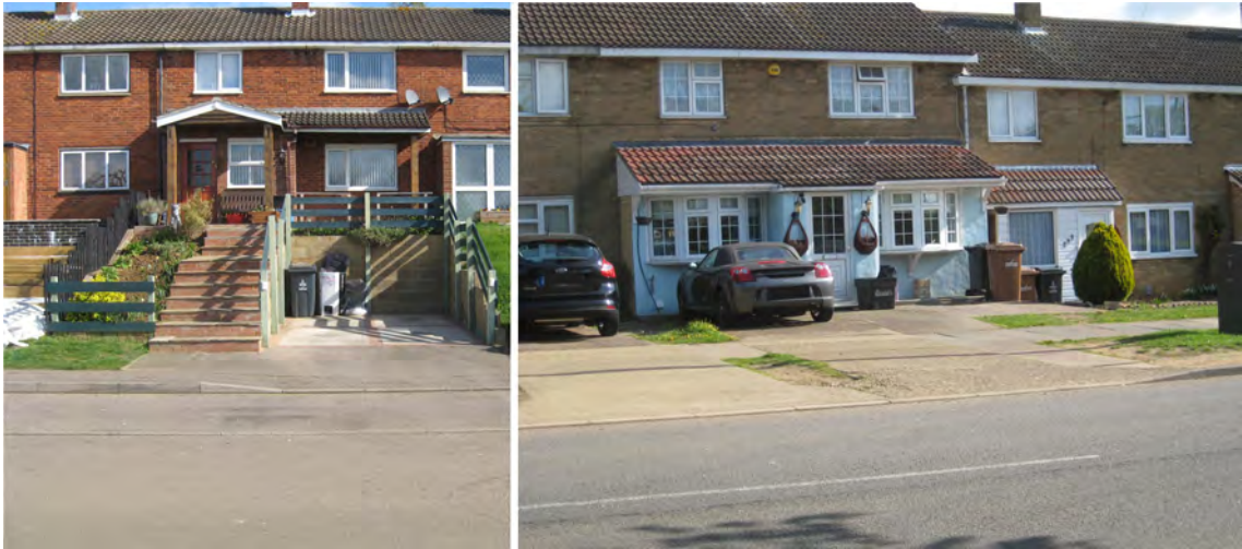
Figure 9 Examples of the loss of front gardens for parking

8.5 Cycling and pedestrian routes are important considerations for sustainable transport and there are a number of routes through the area, as figure 10 illustrates.