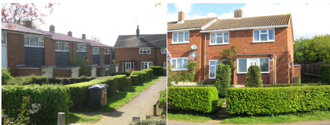
Figure 15 Hedge boundaries on Burydale and Spring Drive