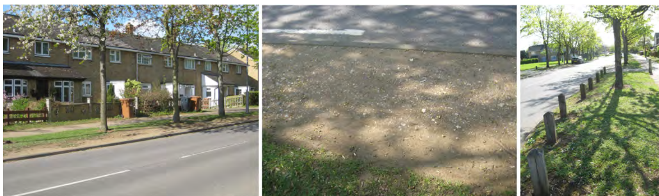
Figure 8 Damage to the grass verge caused by parking

8.3 The parking provision within the area reflects the overall situation in Stevenage, with insufficient parking spaces for the number of cars. This has resulted in cars parking on grass verges, causing considerable damage. Wooden posts have previously been inserted into verges to prevent parking and these have been effective despite not being used extensively.