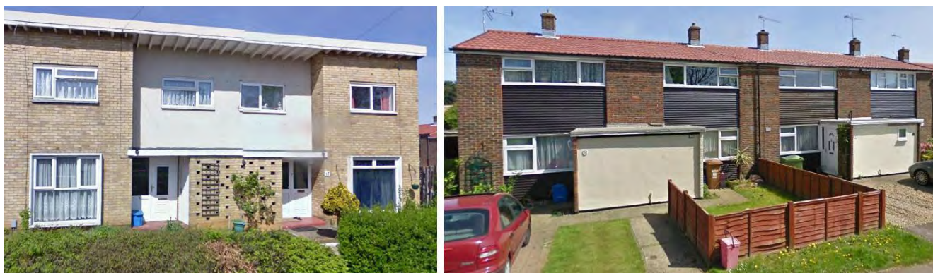
Figure 11 Designs illustrating the plain, linear 1950s style

9.2 Alterations and extensions should not dominate an existing building's scale or alter the composition of its main elevations. Any alterations, including partial demolition, should respect an existing building and its materials. All new work should complement the old in quality, texture, colour and method of construction. Given that a significant strength of the area is the visual attractiveness of front porches and brick work, artificial wall claddings and coatings would be considered inappropriate on any elevation and front porches should normally be of flat roof construction. Walls and stone detailing which have traditionally not been painted should remain undecorated.