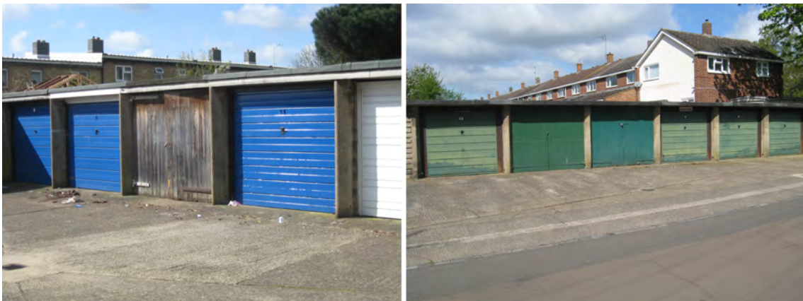
Figure 13 Examples of traditional and restored garages

9.12 The garages within the conservation area are of unusual design and construction. Internal garages were not built and instead 'en-bloc' garages were constructed throughout the area, with many added after the houses had been built due to an original under provision. Although very few of the original timber doors with cast iron straps and pintle hinges remain, it would be desirable to make replacements with this traditional style of door. Examples within the town of refurbished doors which are in keeping with the original designs are given in Figure 13. However, the cost of such options will need to be carefully measured against the benefits to the preservation of the area. Opportunities for heritage funding may also be considered.