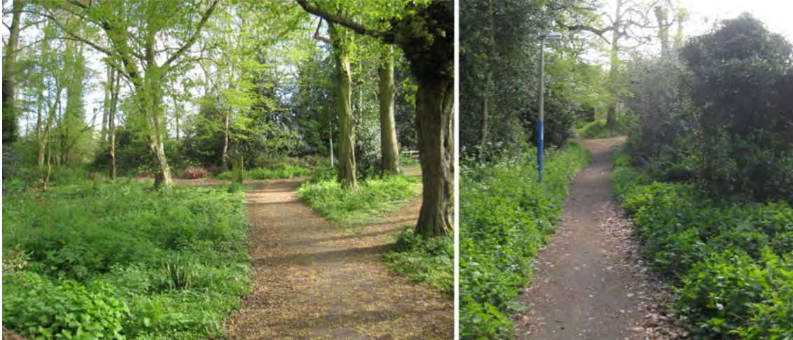
Figure 14 Natural woodland at Marymead Spring

recreation. The link is an essential part of the urban structure of the town and protected through policy within the Stevenage District Plan (2nd Review). We will continue to protect this link through emerging planning policies.