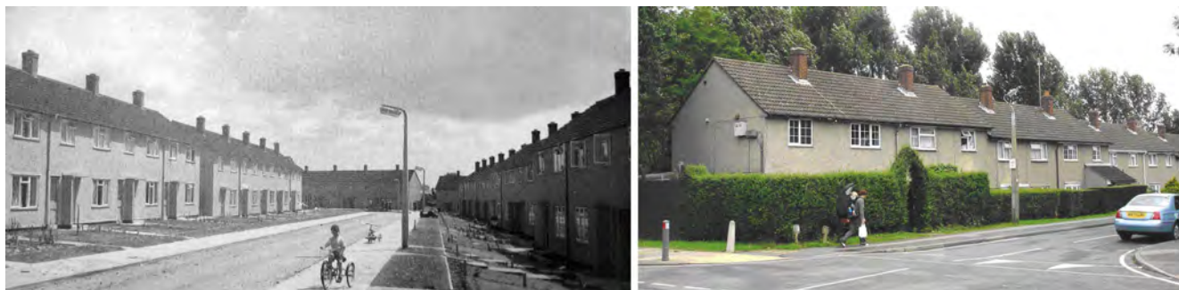
Figure 3 Marymead housing 1954 and Wimpey no-fines housing

5.5 The designs of the two storey terraced housing varied throughout the Broadwater area, and this is reflected in the conservation area, with terraces built comprising of 6-10 houses with long rear gardens. Some of the first houses constructed were "Wimpey no-fines" homes, which were built using a new construction method involving large reusable moulds held in place whilst concrete for the outer structure of the dwelling was poured in all at once.