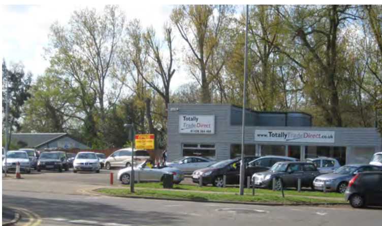
Figure 7 Car showroom as of April 2011

7.2 The Broadwater (Marymead) Conservation Area Appraisal highlighted the vacant car showroom on the south side of Broadwater Crescent as a site that has a negative impact on the area. The building is of late 20th century construction, and has a grey painted metal clad exterior, which stands out and does nothing to enhance the conservation area. The site is comparatively large for the area at 0.2ha. The site was identified in the North Hertfordshire and Stevenage Housing Land Allocation Assessment (2008) (SHLAA) as a site which is “Suitable, Available and Achievable” for residential development. As such, it is predicted that the site may be brought forward for the development of approximately 13 dwellings in the period 2011-2016. However, since the assessment was undertaken, the car showroom and grounds have come back into use, with used car sales as well as car washing and valeting.